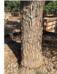
Bark & Trunk