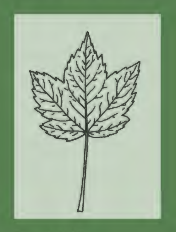
Broad and flat