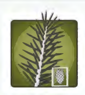
Needles evergreen, single, flat or 4-sided; seeds in cones

Needles deciduous (or evergreen), in tufts of 10 or more on dwarf shoots, also single on long shoots; seeds in cones