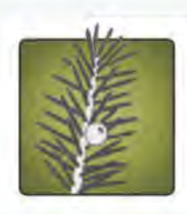
Needles evergreen, single, flat; twigs and buds green; single seed in a fleshy cup