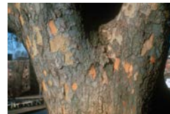
Bark & Trunk