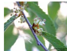
Seeds & Flowers