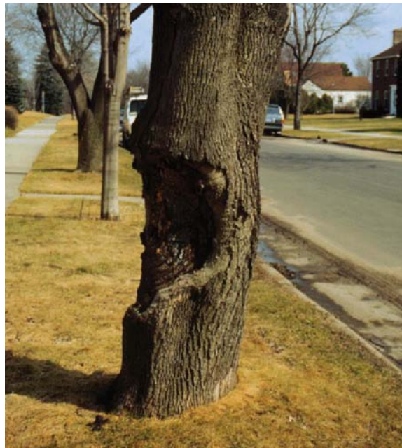
Figure 5. The large canker on this tree has seriously weakened the stem.