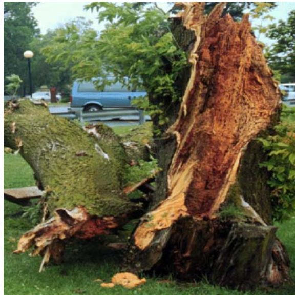
Figure 4. This seriously decayed tree should have been evaluated and removed before it failed.