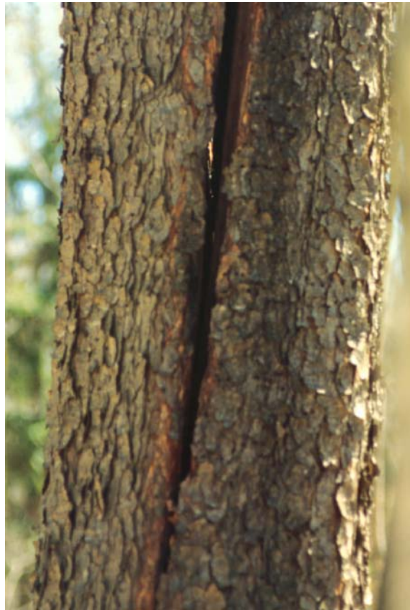
Figure 2. A serious crack like this one indicates that the tree is already failing!