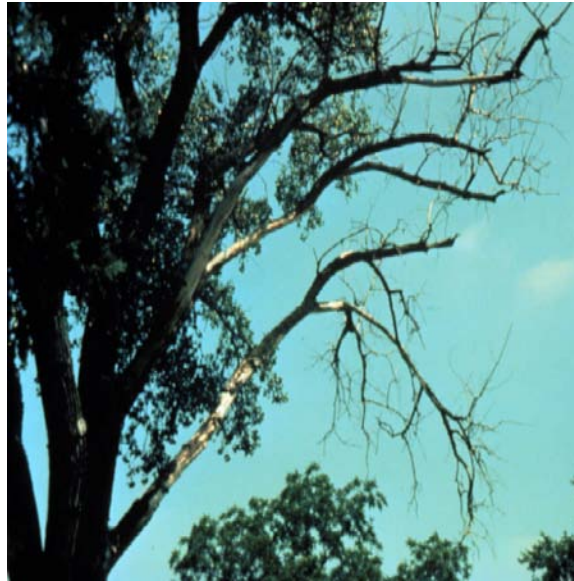
Figure 1. Dead branches can break and fall at any time.