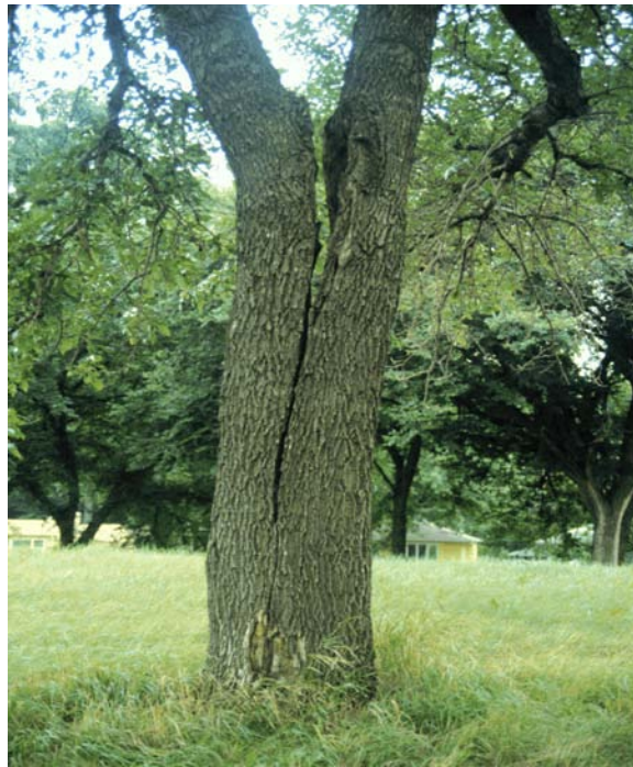
Figure 3. This weak branch union has failed, creating a highly hazardous situation.

act as a wedge and force the branch union to split apart. Trees with a tendency to form upright branches, such as elm and maple, often produce weak branch unions.