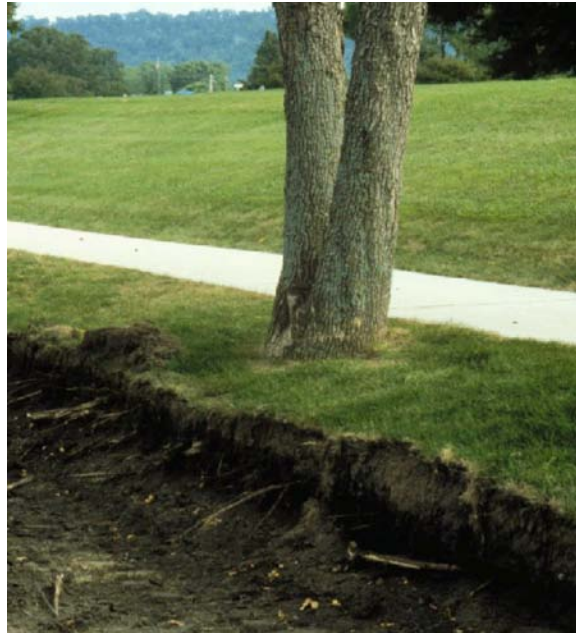
Figure 6. Severing roots decreases support and increases the chance of failure or death of the tree.

than normal leaves are symptoms often associated with root problems. Because most defective roots are underground and out of sight, aboveground symptoms may serve as the best warning.