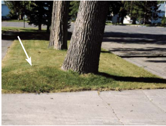
Figure 7. The mound (arrow) at the base of this tree indicates that the tree has recently begun to lean, and may soon fail.